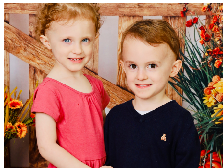
The Kids Enjoying Furlough