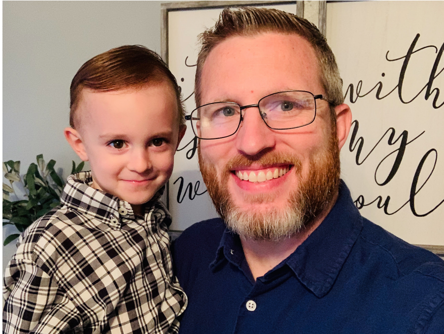
Me and My Buddy